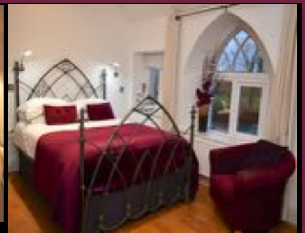
TUDOR Lodge, Bed & Breakfast, Jameston.