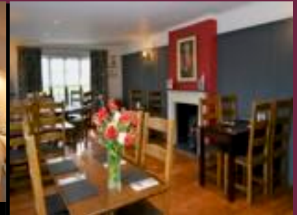
TUDOR Lodge, Jameston, Pembrokeshire